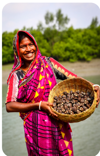
Hand-in-Hand marks FAO's renewed desire to promote market-based transformation of agrifood systems.

Hand-in-Hand is a flagship FAO initiative that provides the support and data needed to enable governments, the private sector and multilateral development banks and other donors to more precisely target agricultural investments for resilient, sustainable and productive agrifood systems. It prioritizes countries and territories where poverty and hunger are highest, national capacities are limited, or operational difficulties are greatest due to natural or human crises.