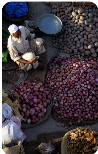
Hand-in-Hand aims to remove the barriers to agricultural investment in low-income, low-capacity countries.

In line with the Government of Niger's decision to transform the country's agricultural sector through the development of agricultural hubs, Hand-in-Hand is supporting investments in the country's southwestern Tahoua and Dosso regions. These investments will target poverty reduction, food security and nutrition through a variety of government-led projects, including the construction of climate-resilient irrigated and non-irrigated production systems, the establishment of effective agrifood companies led by women and young people, and the strengthening of institutions to support innovation and inclusive territorial planning. For example, a USD 60.3 million investment in Niger's organic onion farming is predicted to increase production by up to 66 percent, benefiting 11 000 households – two fifths of which are headed by young people – while delivering an internal rate of return of 41 percent.